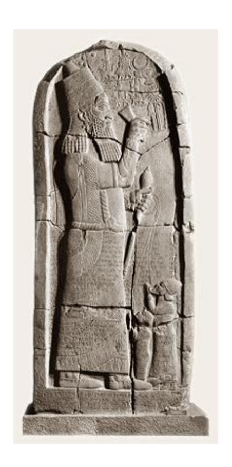
Figure 4. The Zendjirli stele of Esarhaddon