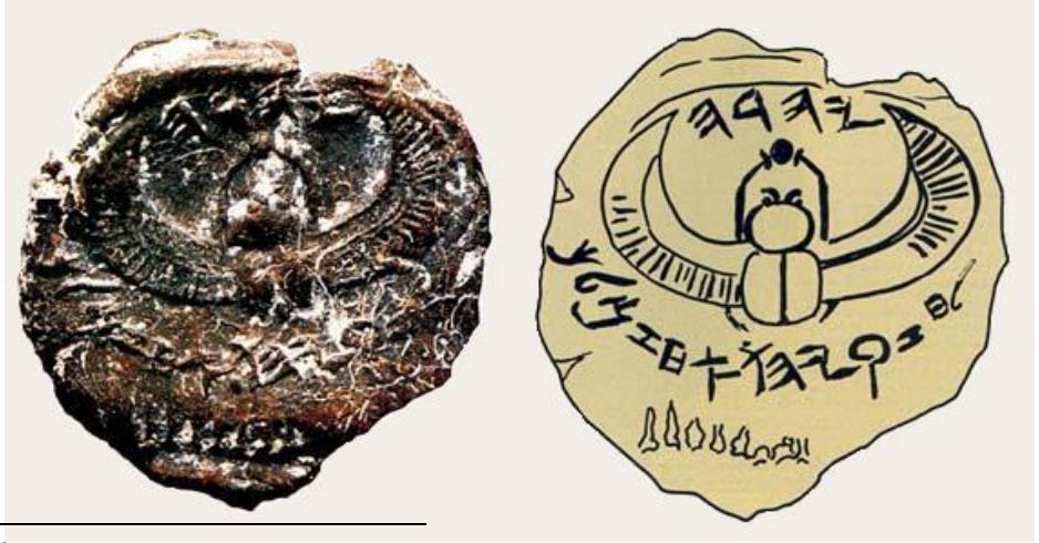
Figure 3. The Scarab Seal Impression of King Hezekiah of Judah